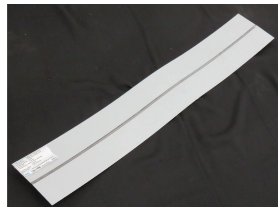
亜鉛めっき鋼板 板厚:0.5mm 突合せ溶接 溶接電流:75A 溶接速度:2.5m/min

■溶接電源:WB-F300P ■送給装置:AFT-4211 ■ロボット:FD-V6 • Welding power source: WB-F300P • Feed system: AFT-4211 • Robot: FD-V6