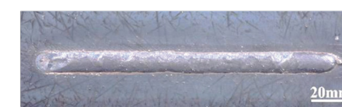
セルフシールド溶接法 Self-shielded welding method