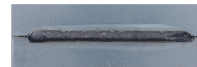
溶融亜鉛めっき鋼板の溶接 Welding of galvanized steel plate