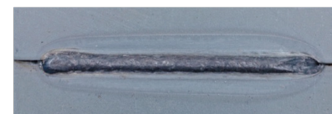
Zn-Al-Mgめっき材の溶接 Welding of Zn-Al-Mg plate